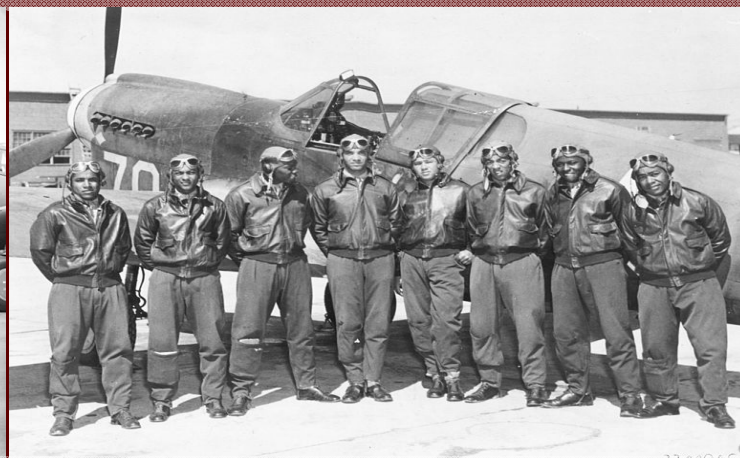
Left: First class of Tuskegee Airmen—1941 / Right: Tuskegee Airmen Circa 1942—1943.