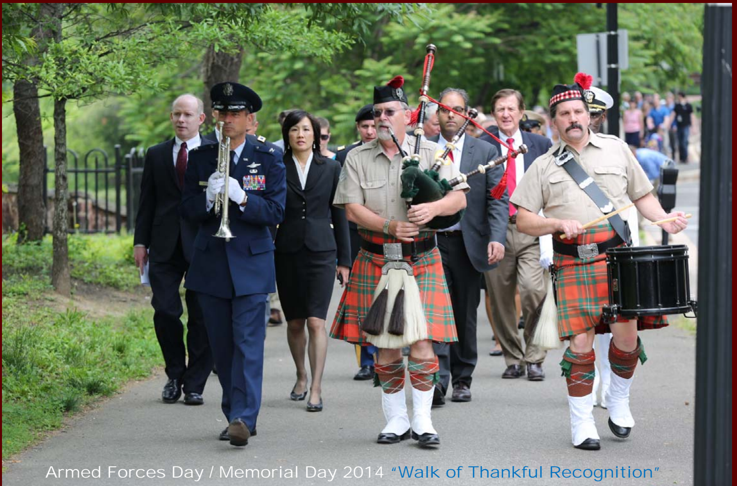
Armed Forces Day / Memorial Day 2014 "Walk of Thankful Recognition"

This article does not list each and every benefit available to disabled Veterans, to learn about other benefits, visit the eBenefits portal and research available benefits in your home state . Or, call the toll free numbers listed here .